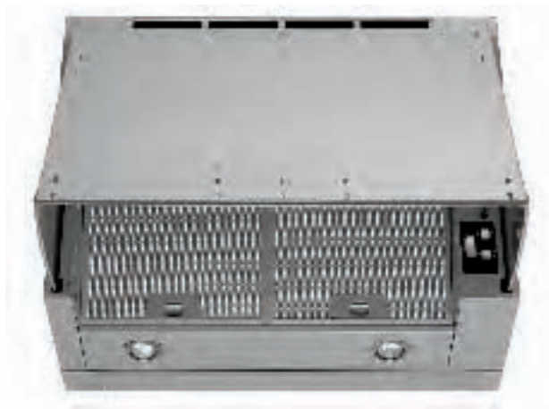
John Lewis 60cm integrated chimney hood JLBIHD 608 Stock number 866 70209