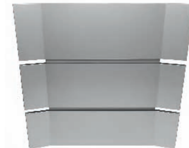
John Lewis 90cm triple-panel hood JLBIHD 908 Stock number 866 70210