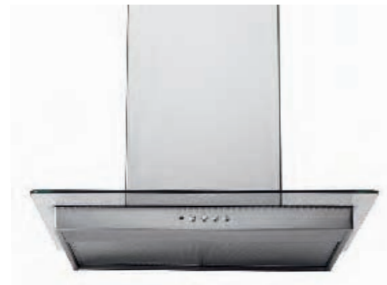
John Lewis 60cm glass canopy chimney hood JLBIHD 603 Stock number 866 70204