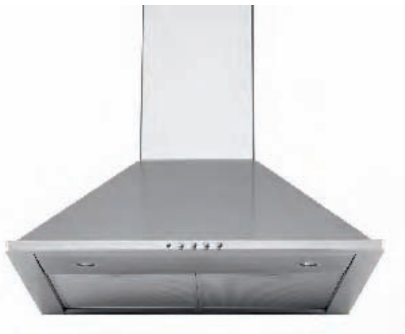
John Lewis 60cm chimney hood JLBIHD 601 Stock numbers 866 70202